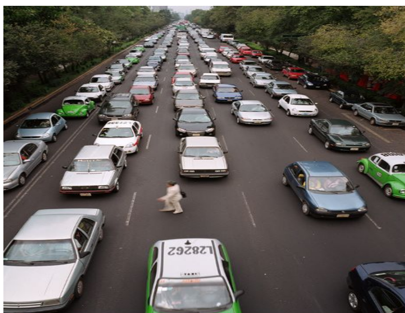
Mexico City street scene

It's obviously not just the number of people that's driving energy demand... it's their expectations. Billions in China and India want – and deserve – to adopt a first world standard of living... complete with cars, computers, washing machines, air conditioners, and high tech factories. Billions more around the world want – and deserve – simply to lift themselves out of poverty with access to clean, cheap energy to cook their food and light their nights.